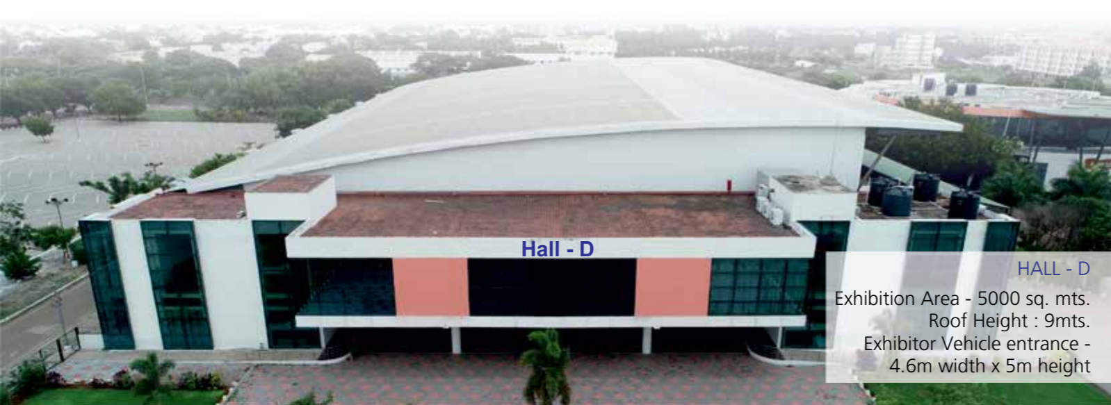
Hall - D